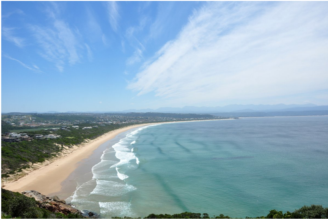
The Garden Route

The Garden Route begins about four hours outside Cape Town and includes one of the most beautiful stretches of coastline. Its starting point is constantly contested as towns such as Witsand, Stilbaai and Albertinia join the route that winds its way for some 200 km via George, Wilderness, Sedgefield and Knysna on to Plettenberg Bay — culminating in the Tsitsikamma Forest, a fairyland of giant trees, ferns and bird life.